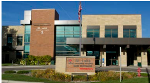
St. Luke Community Hospital & Nursing Home