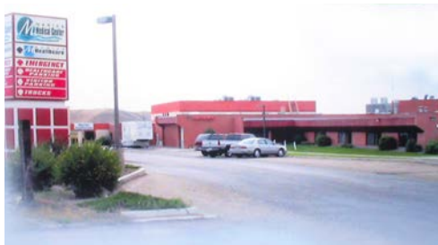
Marias Medical Center

Benefit: The reduced interest rate will result in $1.7 million in savings over 16 years.