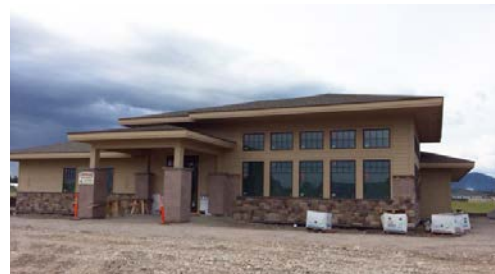
North Valley Hospital

Benefit: The reduced interest rate and extended term will result in annual cash flow savings of $39,000.